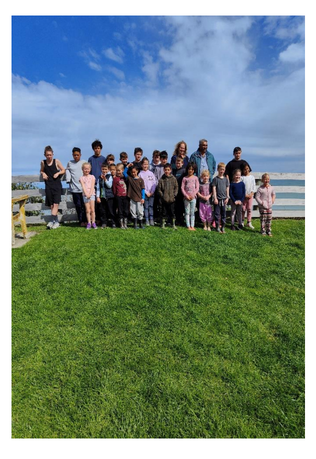
Mokau School Proudly Sponsored by: