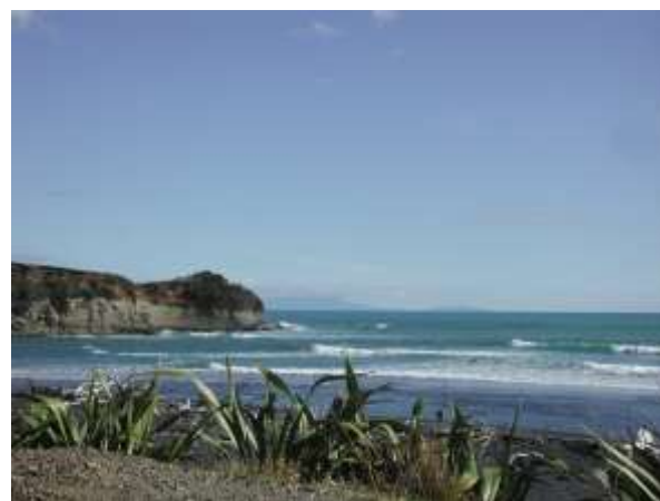
What an amazing view!